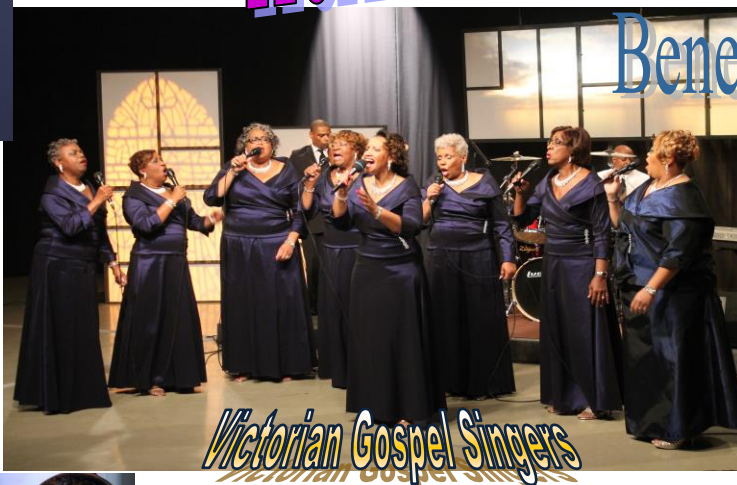
Victorian Gospel Singers